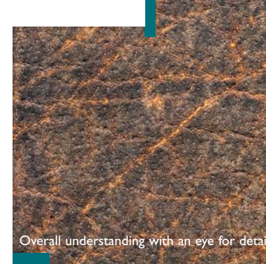
Overall understanding with an eye for detail