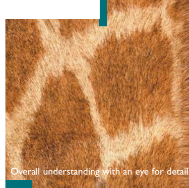
Overall understanding with an eye for detail